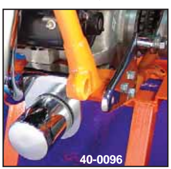
Pura-Flow Chrome Oil Filter Kit for 1936-99 Big Twins.